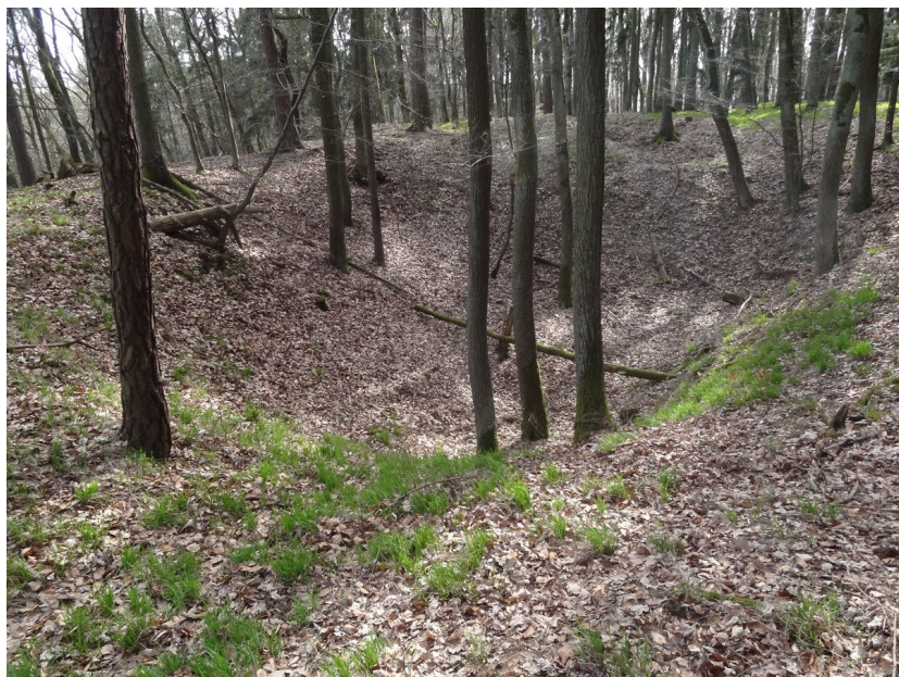
Pit mines connected by a channel.