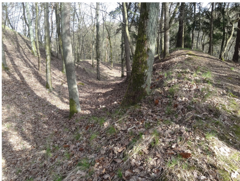
Outer fortification of the castle.