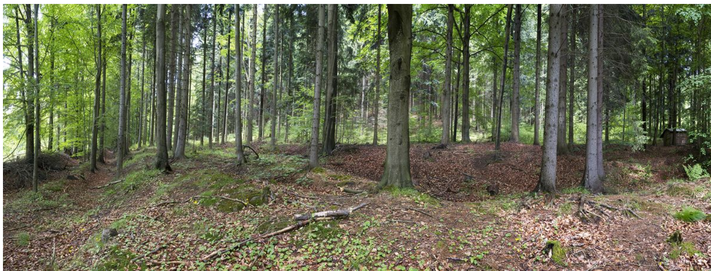
Hollow ways of the Golden Trail.