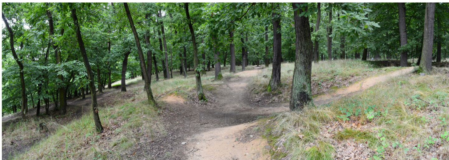
Built-up area of the siege camp.