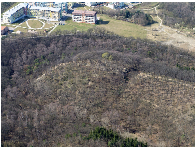
Aerial view of the castle.