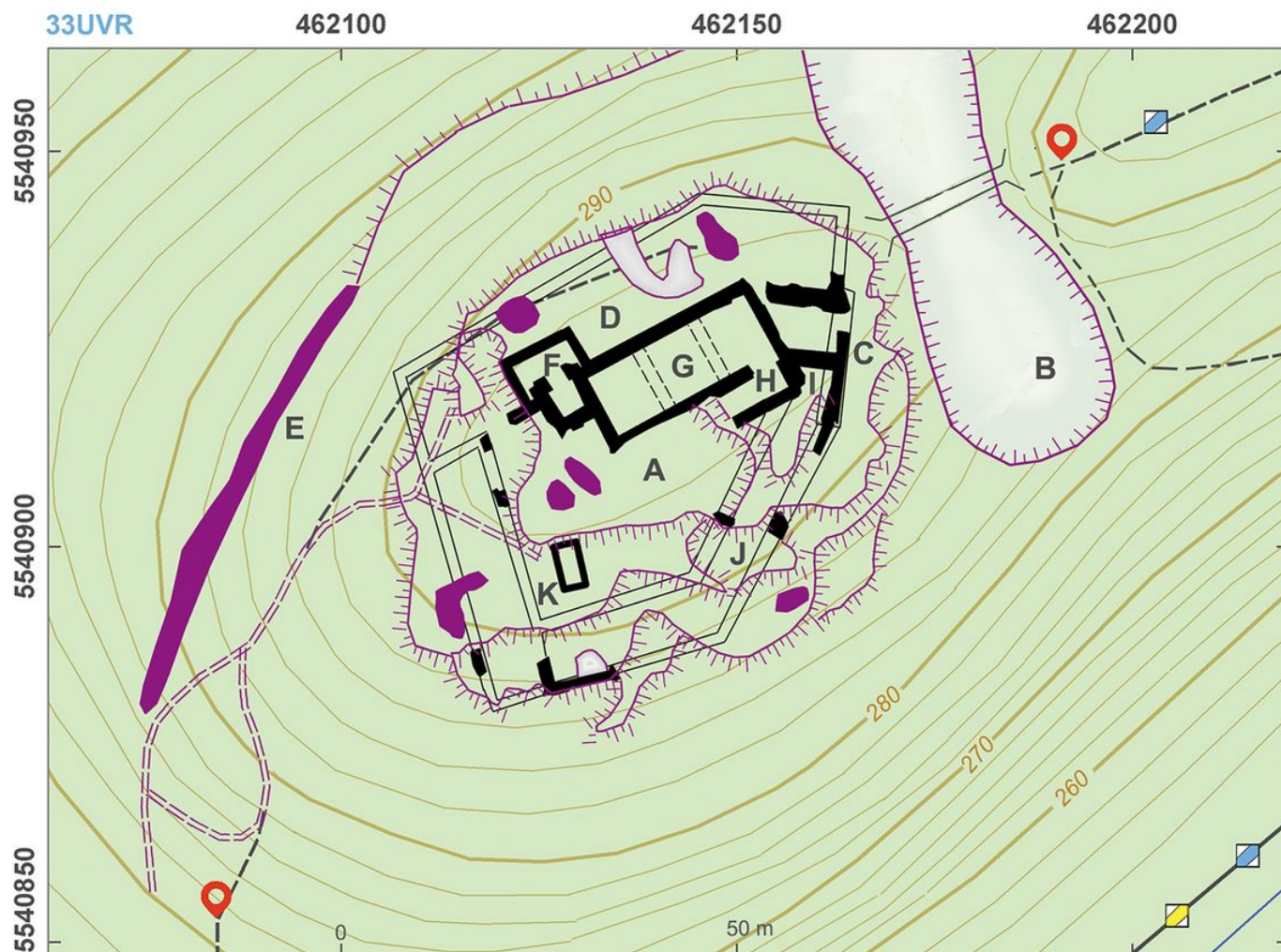
Site plan – castle core.