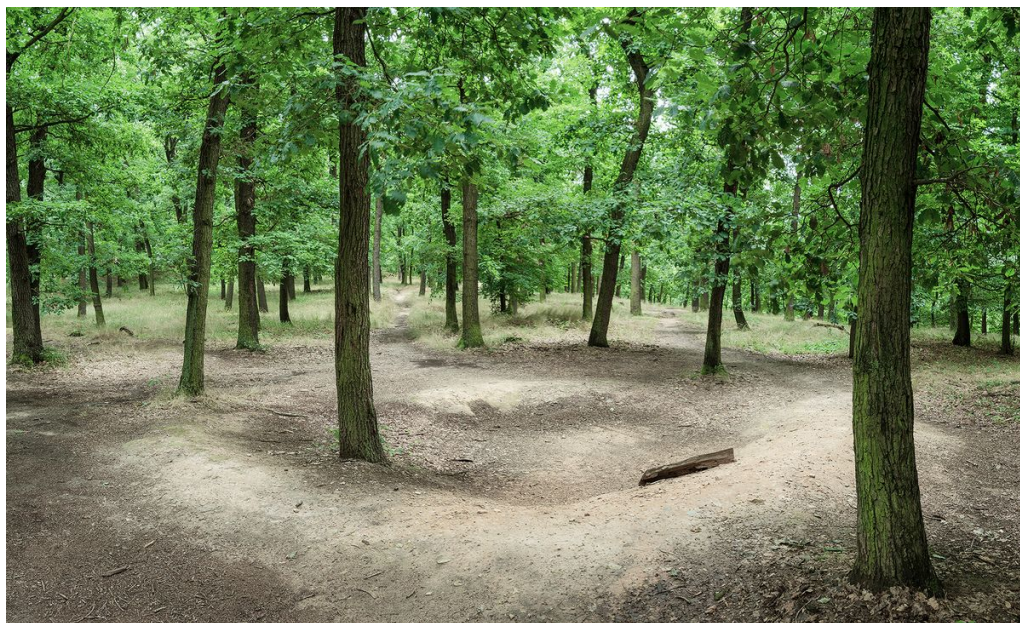
Surface relicts of buildings belonging to the siege camp.