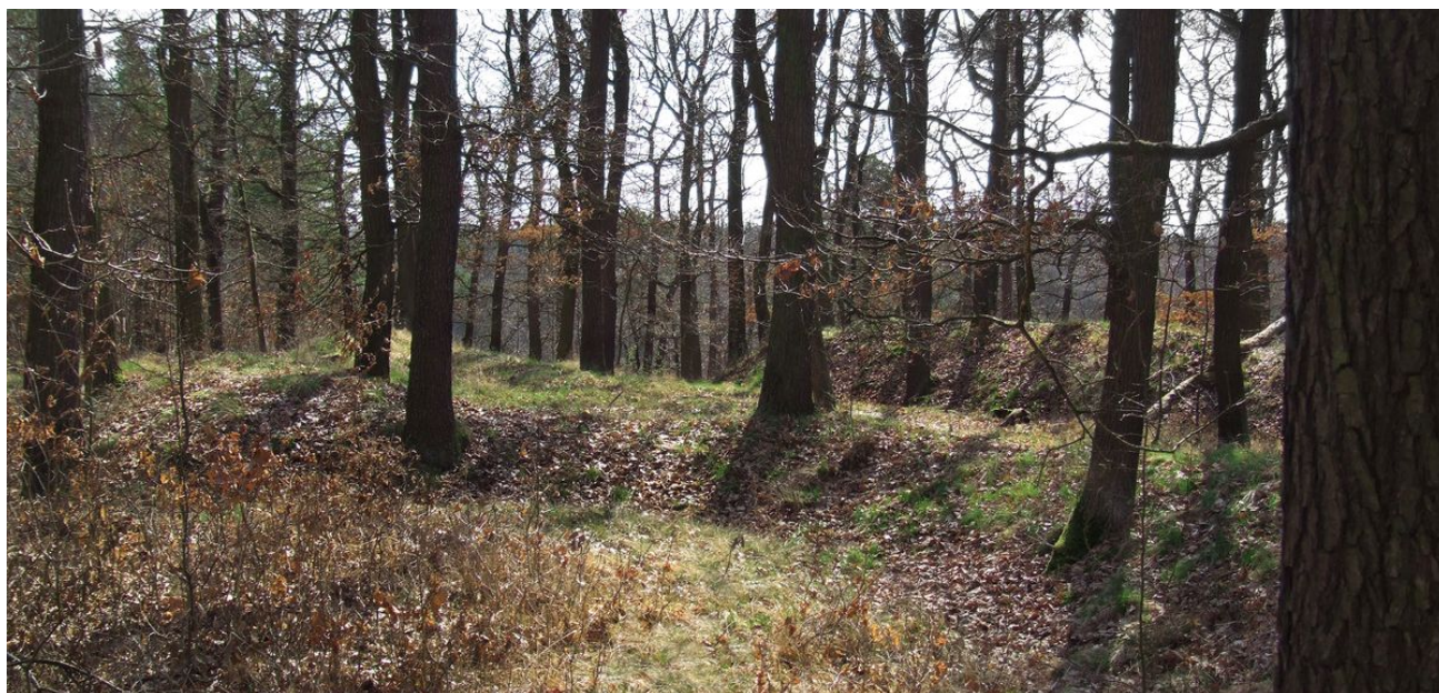
Northeastern fortification of the siege camp.