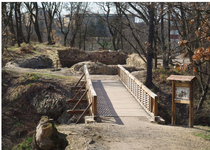
Castle core with a cellar of the tower-like palace. View from north-east, across the moat.