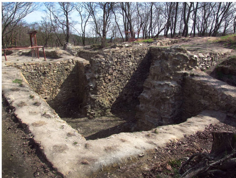
Second gate with a walled-in moat. Photo J. Hložek, 2014.