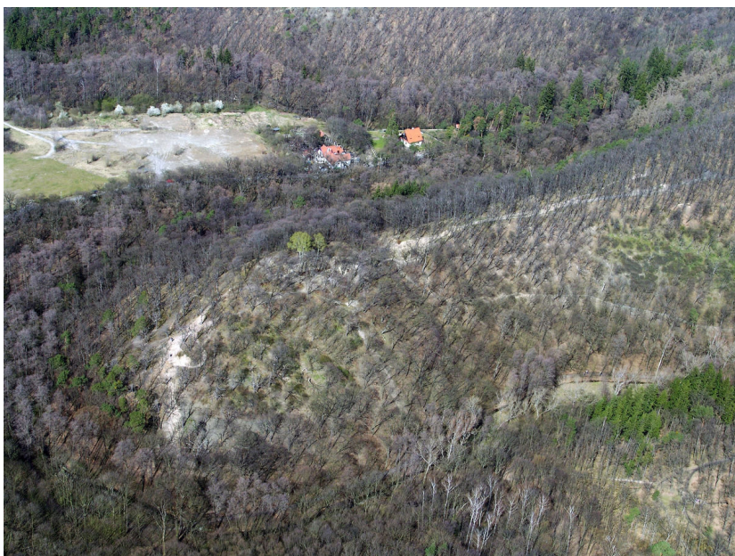
Aerial view of the castle.