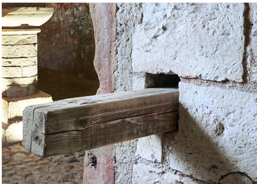
Bolt next to the entrance to the basement's southern room.