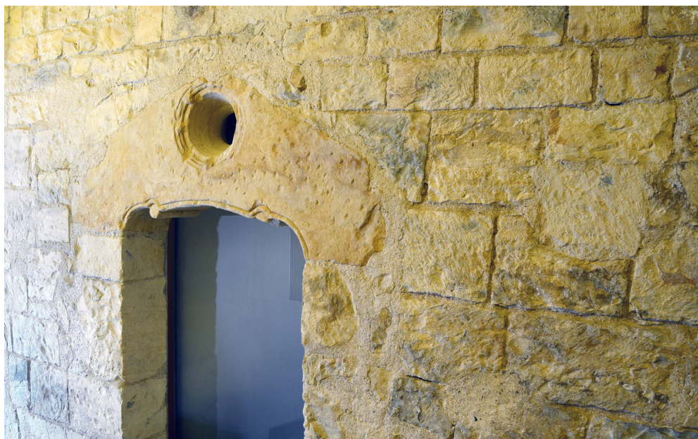
Romanesque small portal on the groundfloor.