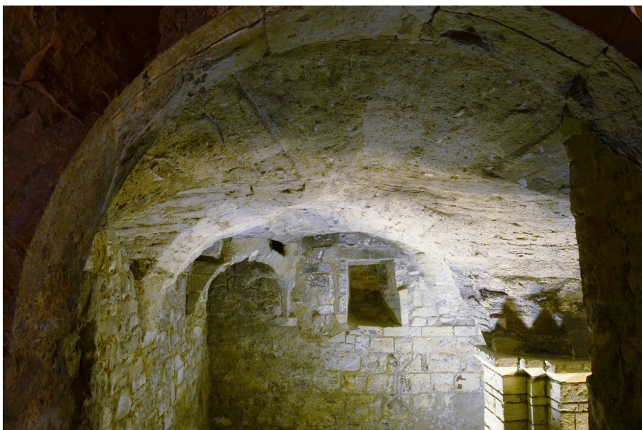
Southern chamber of the basement.