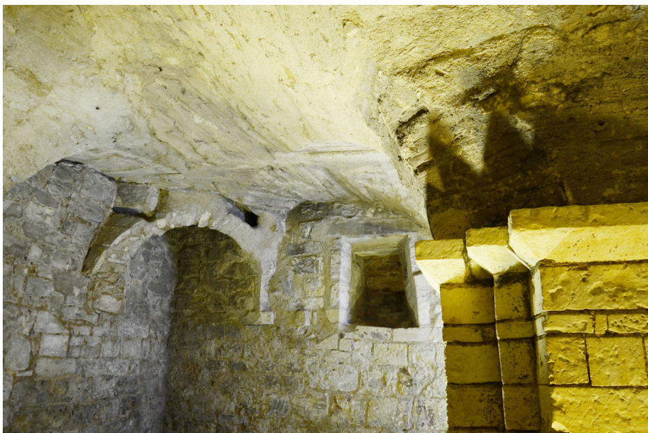
Southern chamber of the basement.