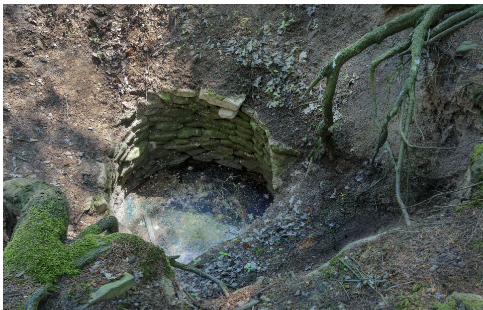
One of two preserved Medieval wells.