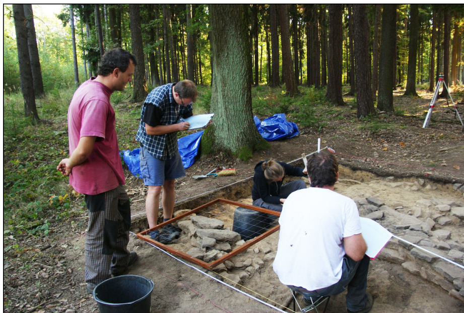
Archaeological field works.