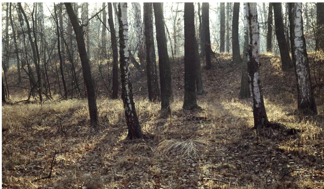
Bank of the former Žák pond.