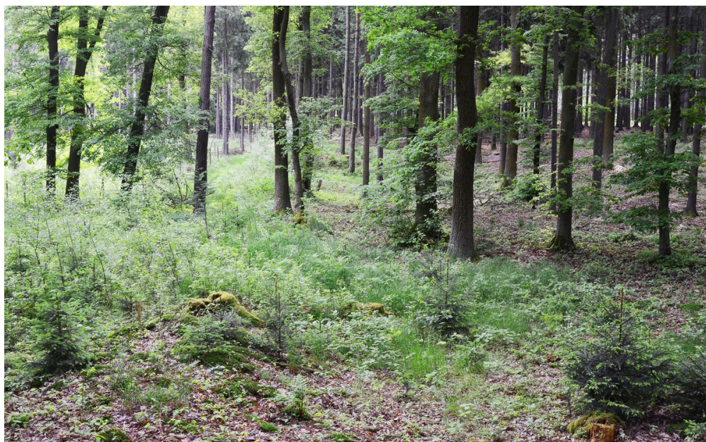
View of the former village square.