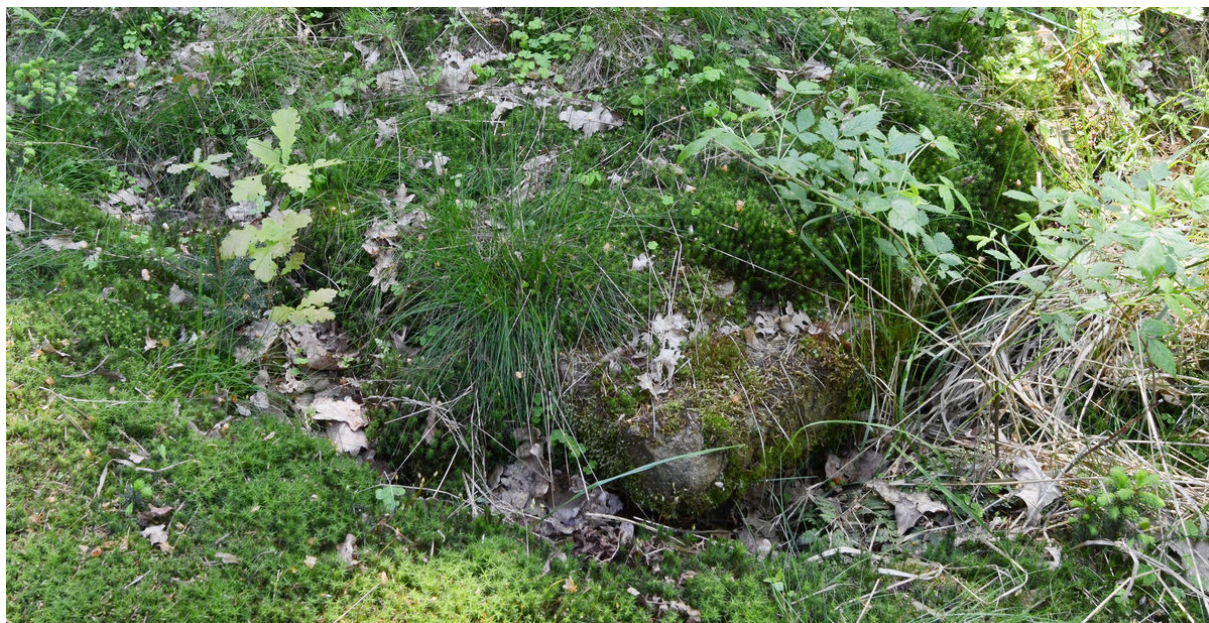
Corner stone of the village mayor's house.