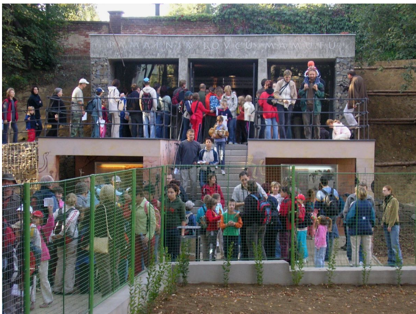
Ceremonial opening of the Mammoth Hunters' Memorial on 7 October 2006.