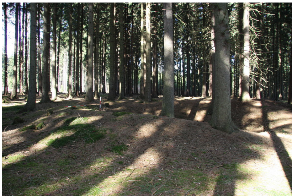
A mining heap witnessing mining activities.