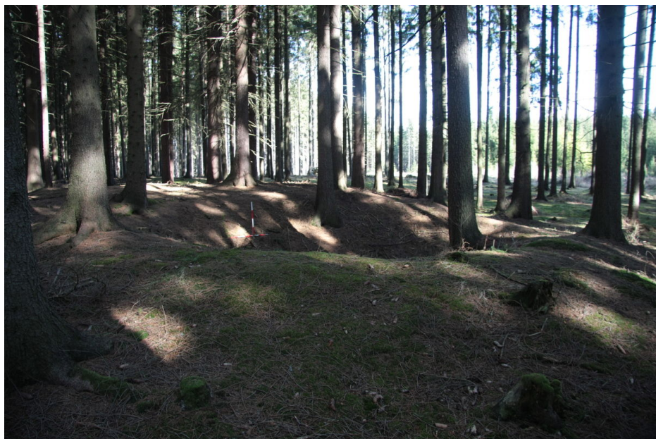
Mining heaps at the Rančářovský couk.