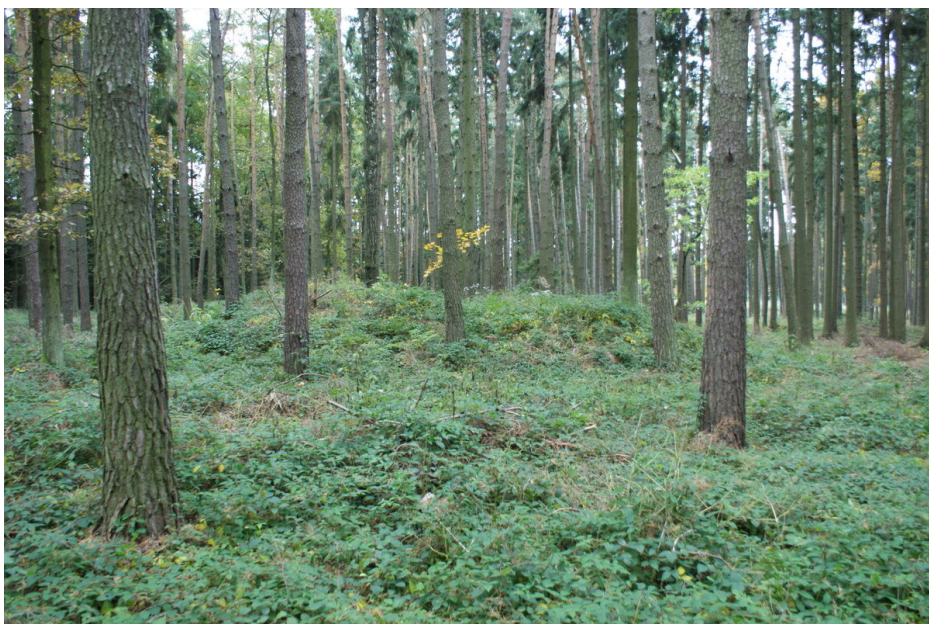
One of barrows on the Prehistoric cemetery.