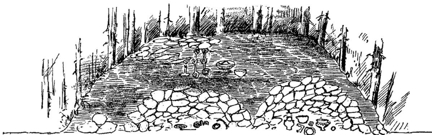
Průřez mohyly čís. 7.