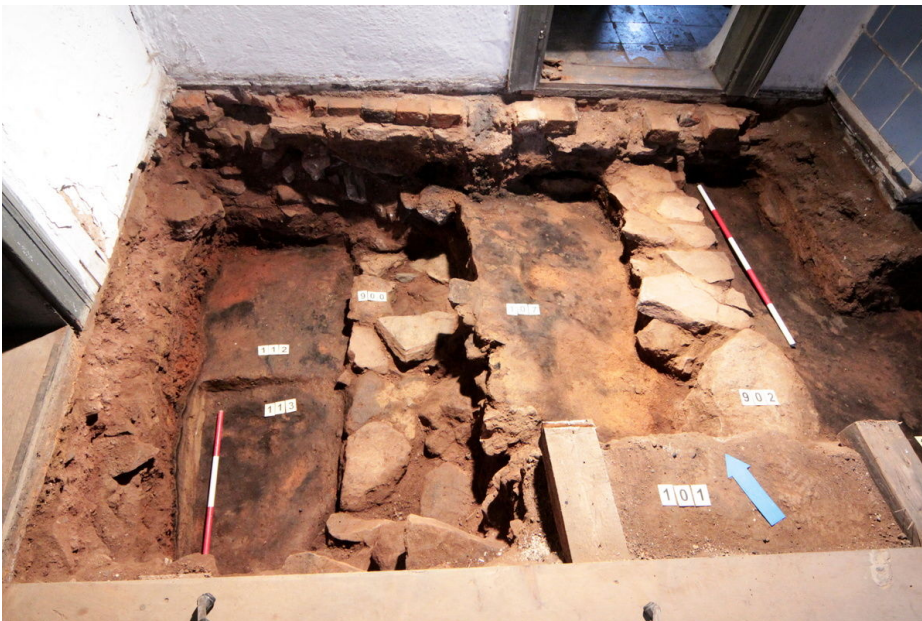
Farmstead No. 36, survey of the floor.