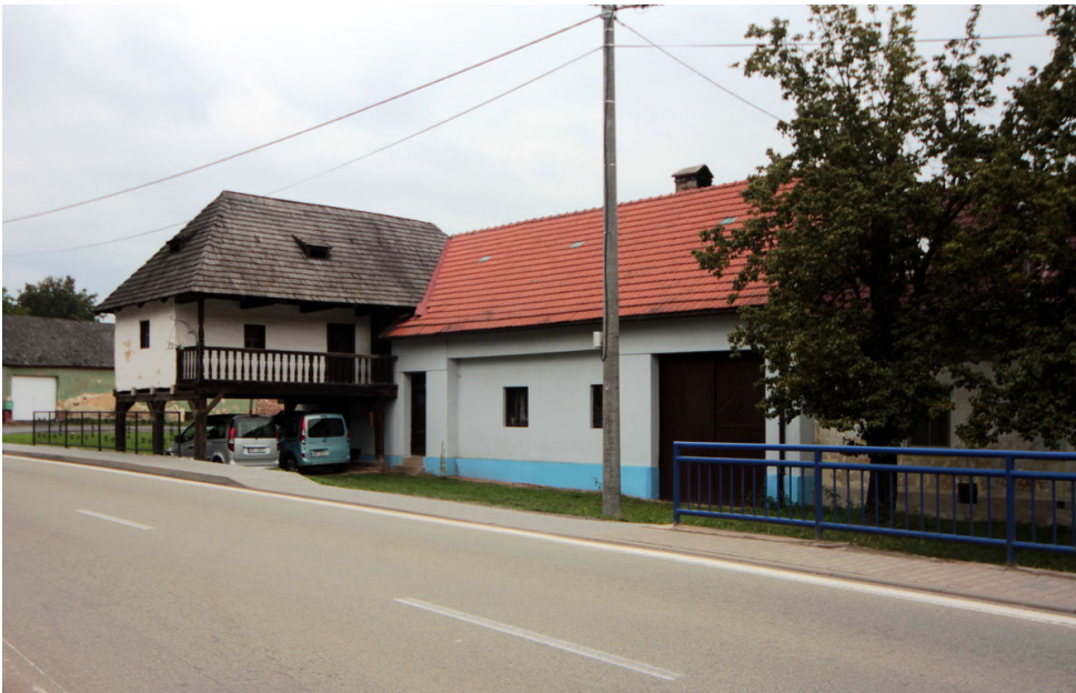
Farmstead No. 36, view from the south-east.