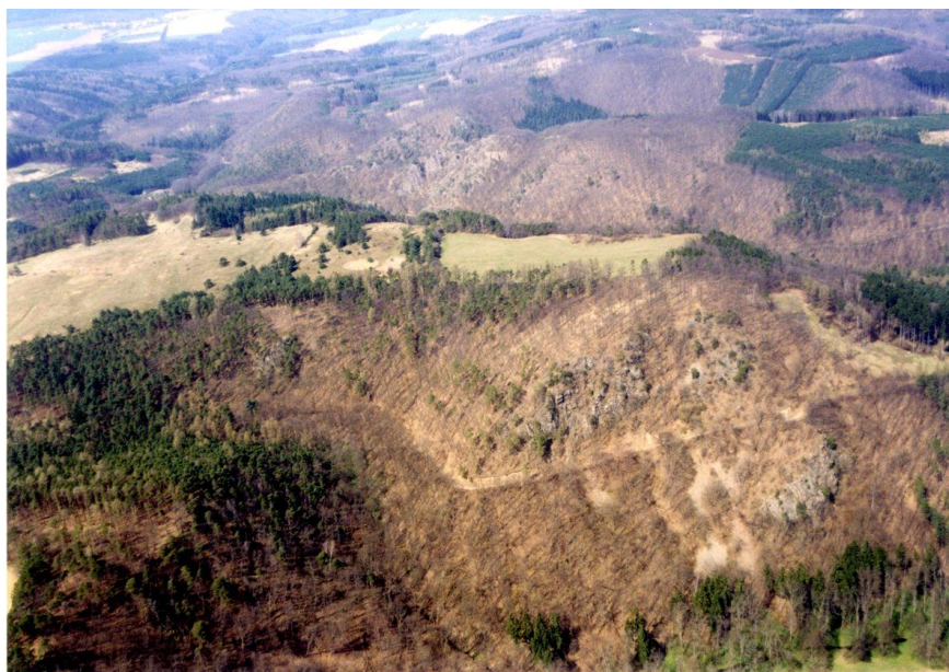
Aerial view of the Velká skála hillfort.