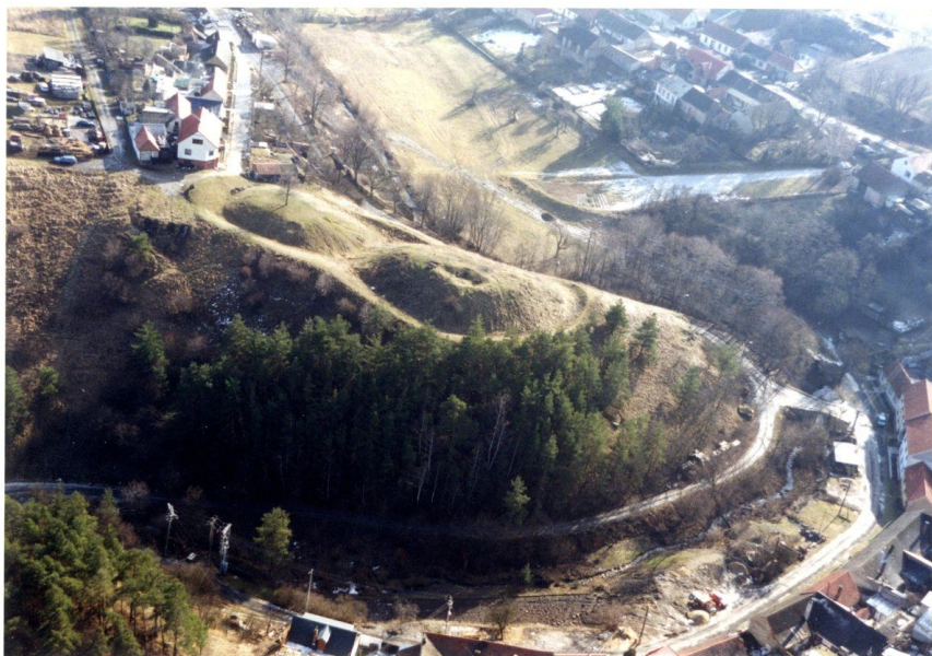
Aerial view of the small castle with well visible relics of the neck ditch.