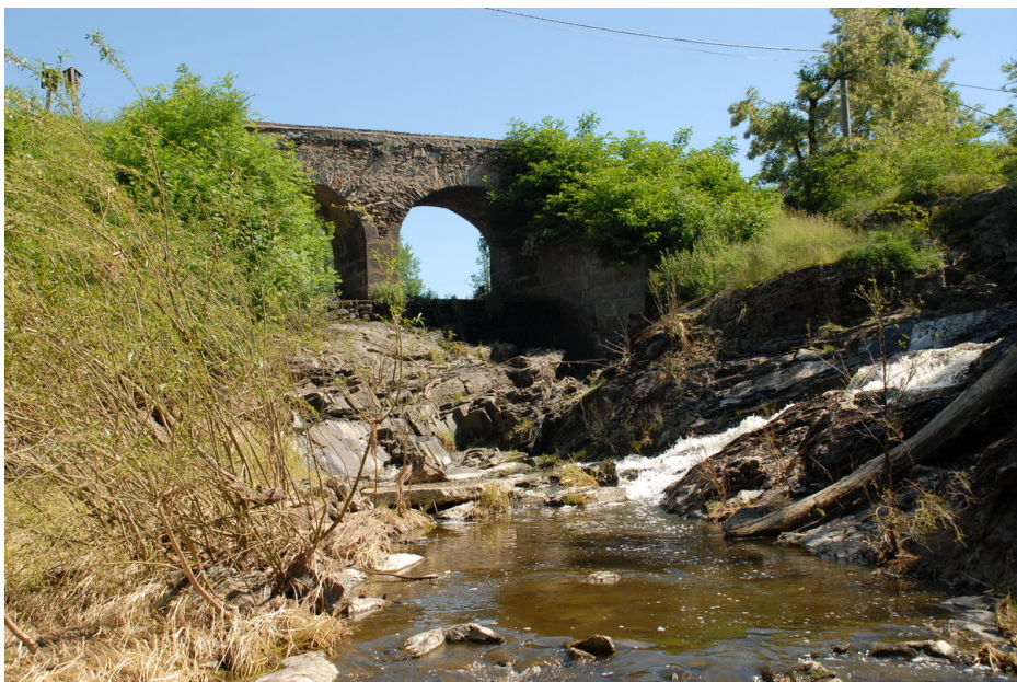
Natural monument "Smutný" below the barrow cemetery.