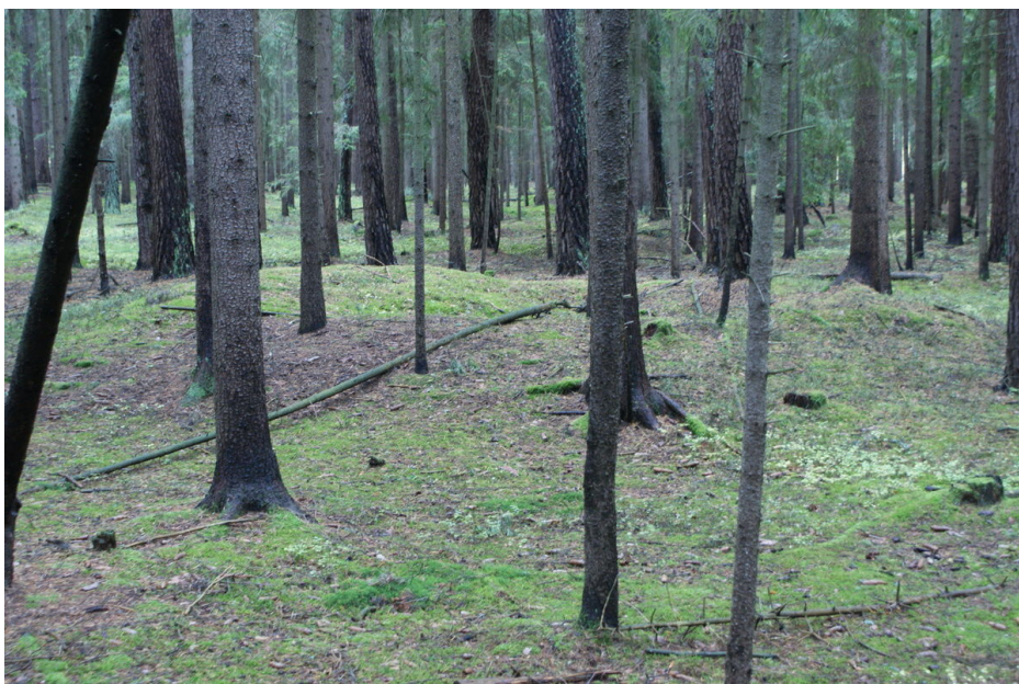
A barrow on the cemetery.