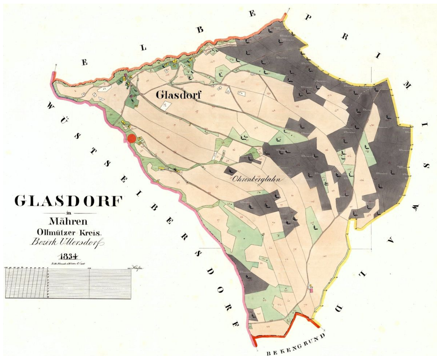
Abandoned glass works on a map from 1834.