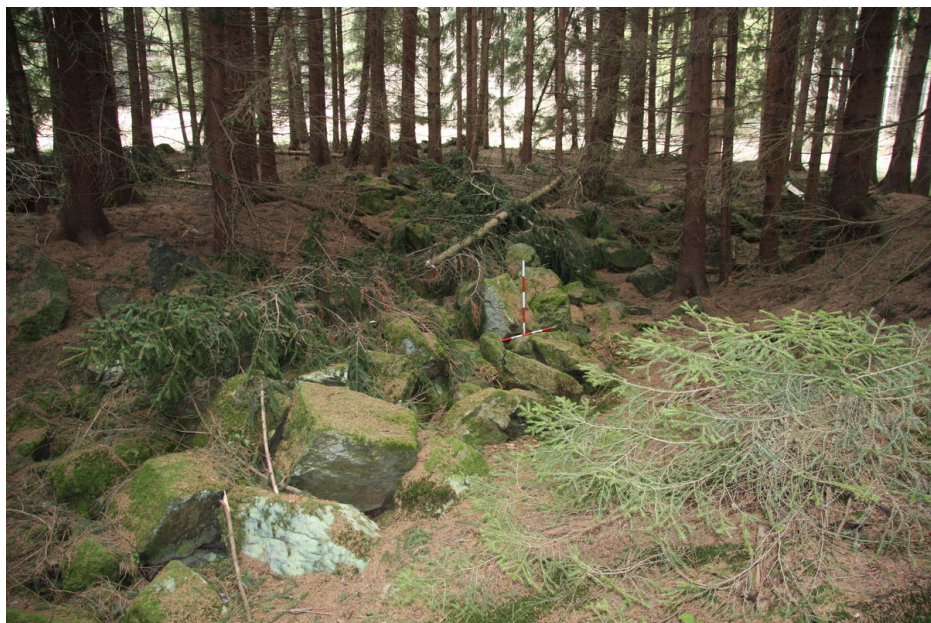
In the northern part, the moat is filled with stones that may stem from the original residential building.