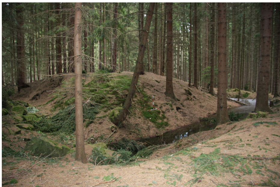
Ruins of a fortress with preserved rampart and motte.