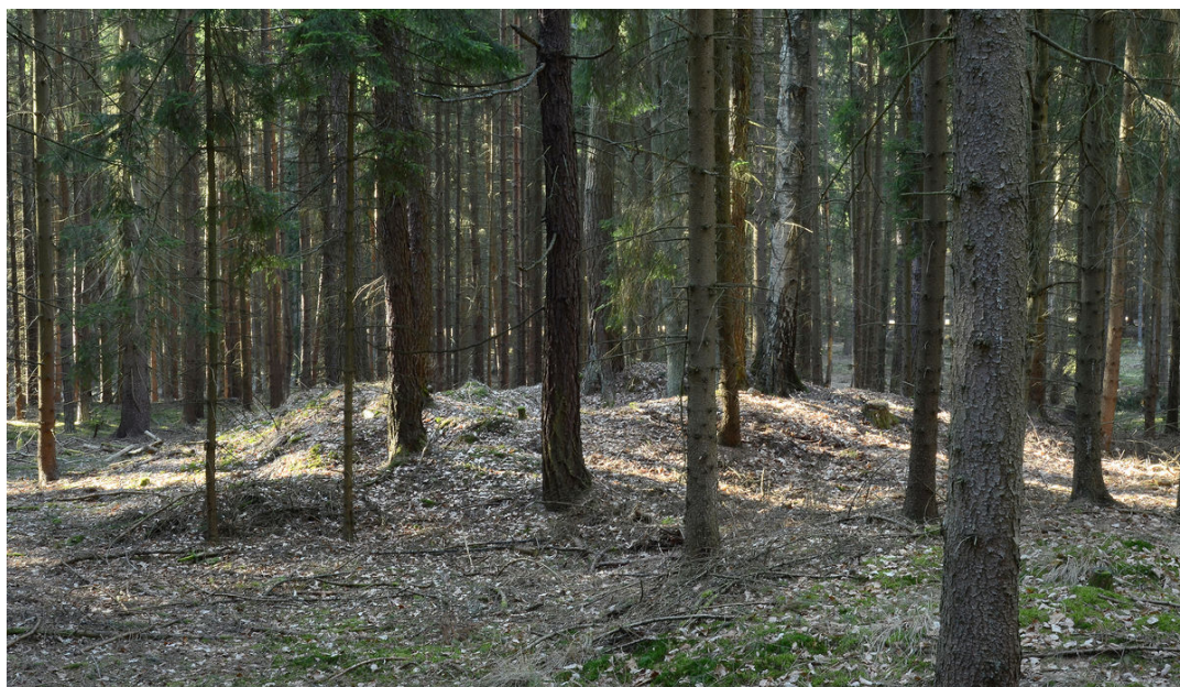
Barrows at the Hájek site.