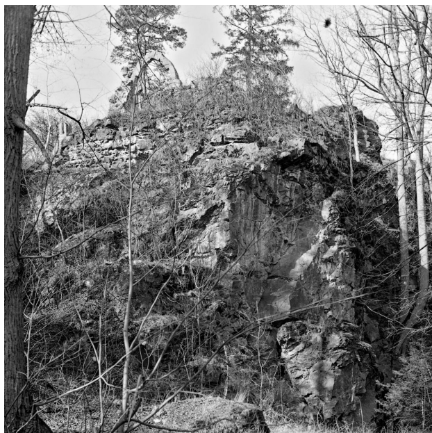
Partly destroyed entrance of the Lopata Castle. Field documentation from 1950s excavations.