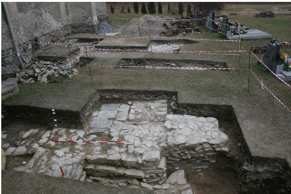
Church of the Immaculate Conception of the Virgin Mary, uncovered walls by the south wall of the presbytery during the excavation.