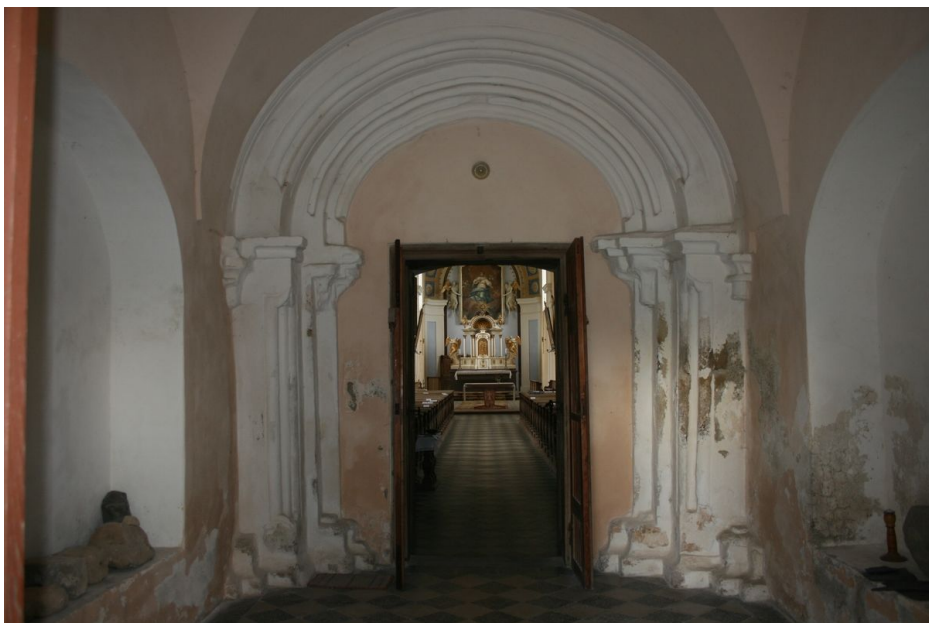
Church of the Immaculate Conception of the Virgin Mary, late Romanesque portal beneath the tower.