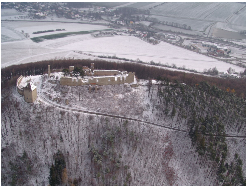
Aerial view from the west.