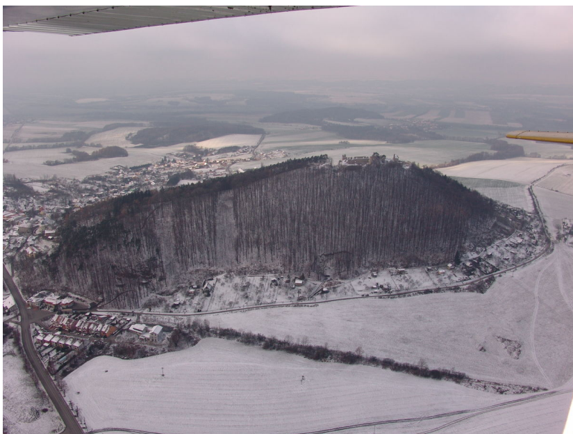
View from the east.