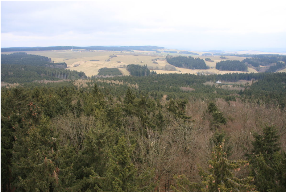
View from the Mařenka outlook tower towards the north.