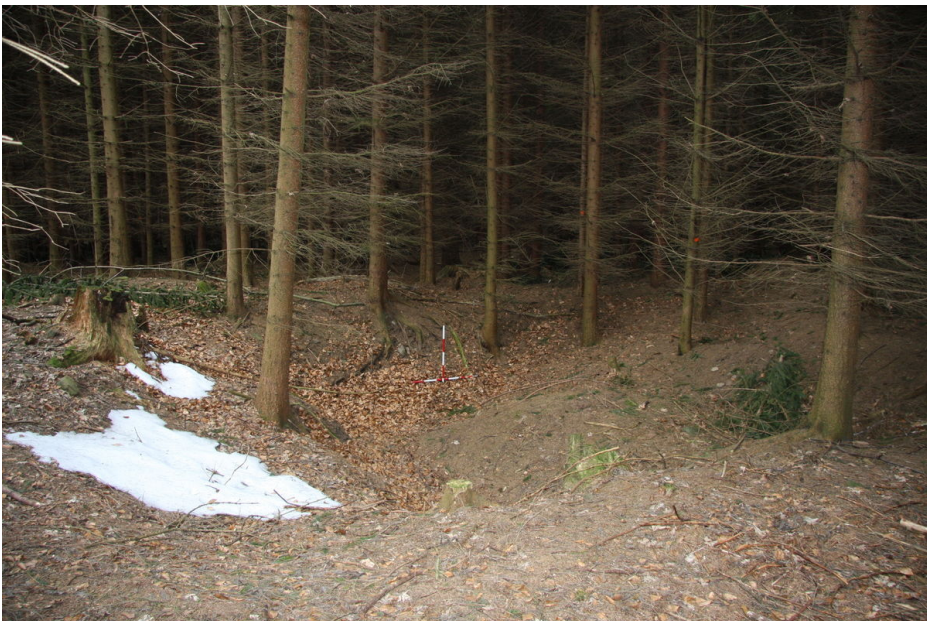
Pits are the only remains of the village.