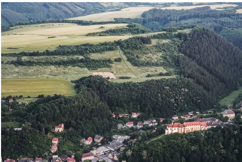
Aerial view of the chateau Nižbor (in foreground) and the oppidum Stradonice.