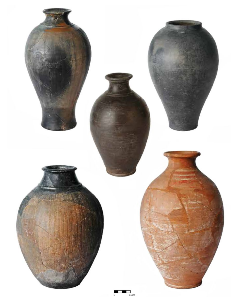
Finds of LaTene pottery from the oppidum at Stradonice. After Valentová 2013.