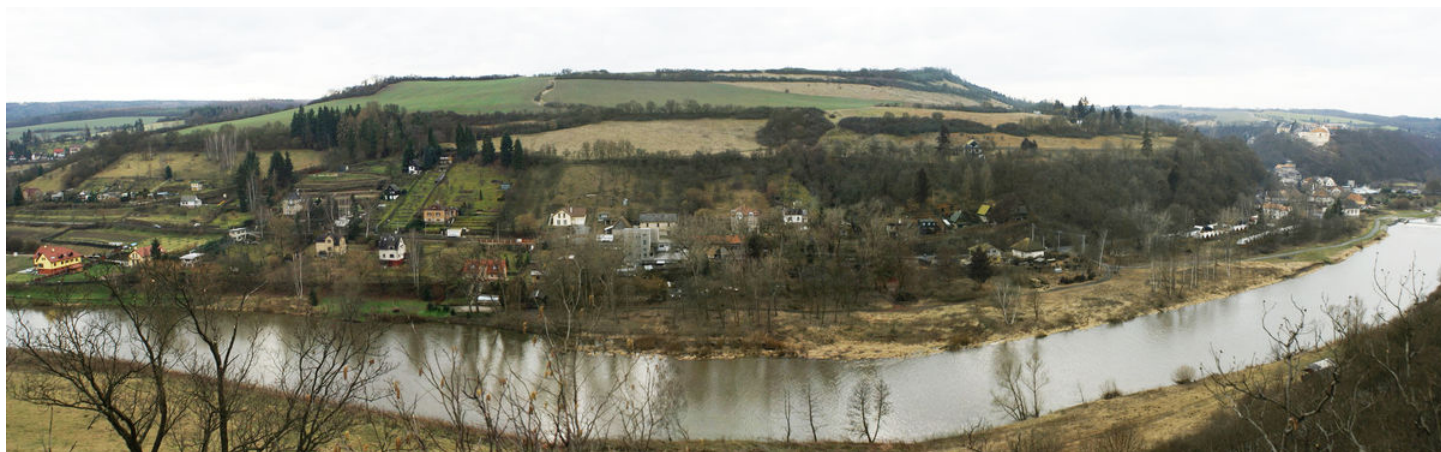
Oppidum Stradonice, taken from the left bank of Berounka river.