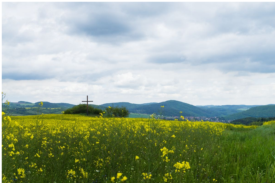
Hilltop of the Stradonice oppidum across a blooming meadow.