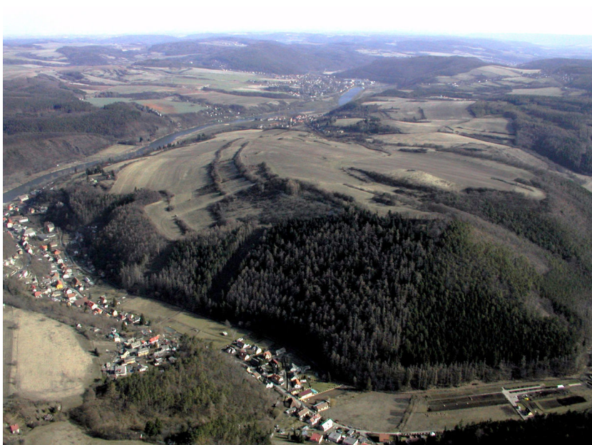
Aerial view of the oppidum.