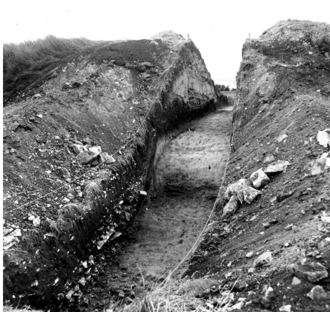
Cross-section of the bank during excavations in 1970s.

After Z. Smrž. Archives of the IoA, TX198004145.