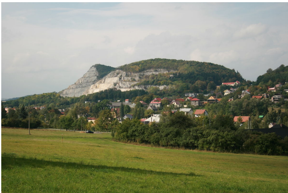
Kotouč hill.