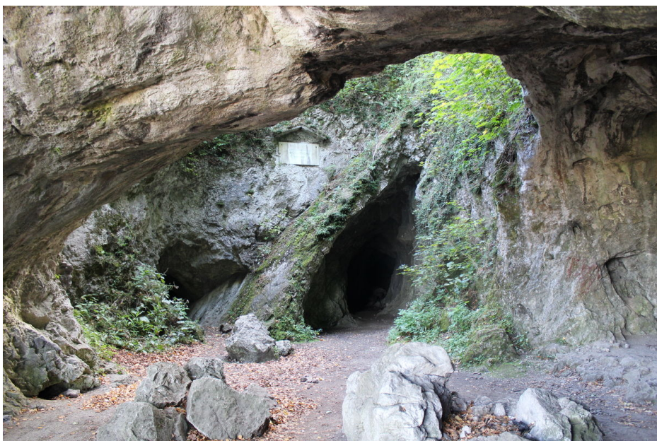
Jezevčí díra ('Badger Hole'; left) and Krápníková chodba ('Dripstone Corridor').