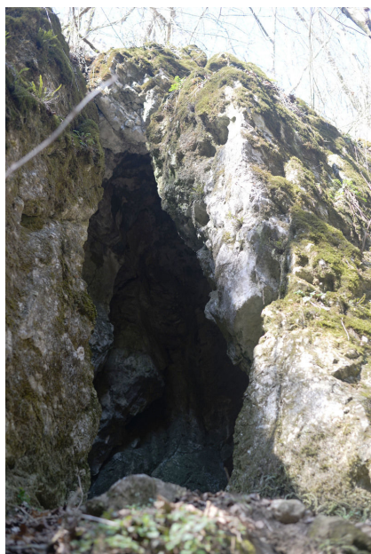
Koňská jáma Cave, main entrance.