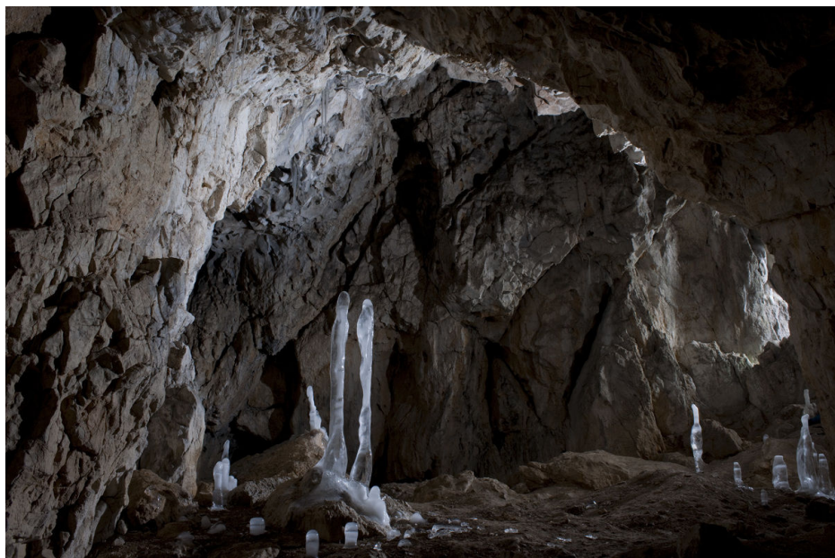
Koňská jáma Cave; the chambers are immediately behind the entrance portal.