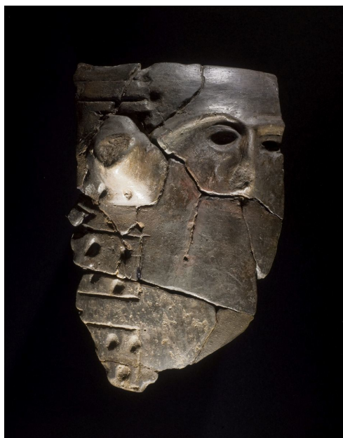
Fragment of a prehistoric ceramic vessel with a human figure (Neolithic; Linear Pottery culture) from Koňská jáma Cave.