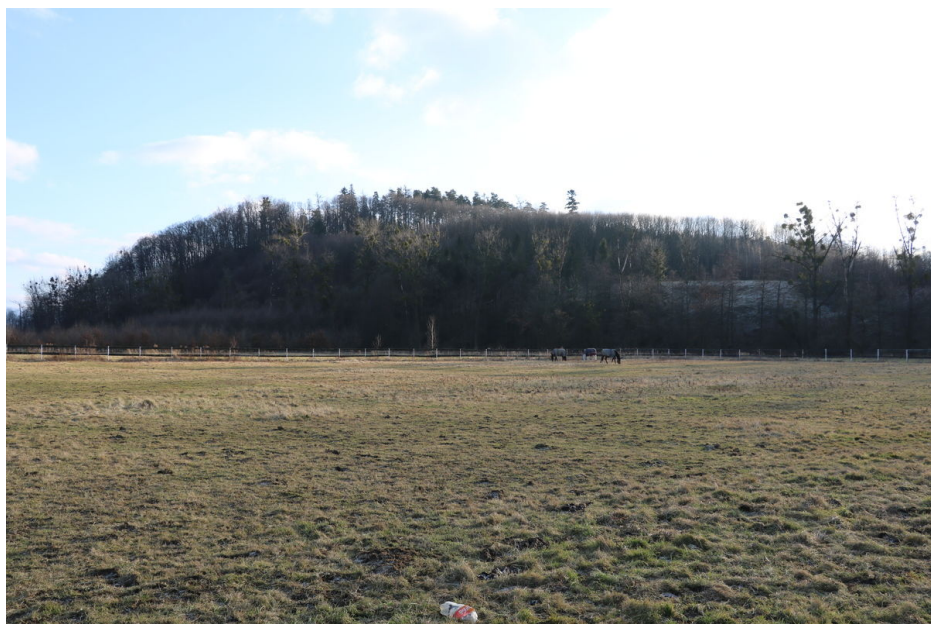
View of the site from the north-west.