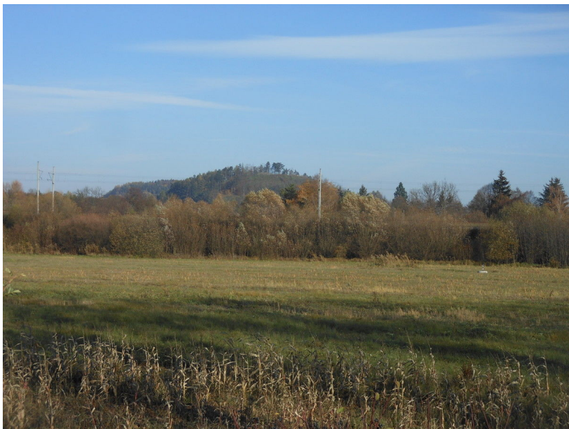
Distance view of the hillfort.