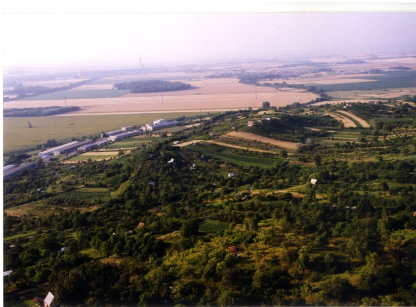
Aerial view of the hillfort from the south-east.