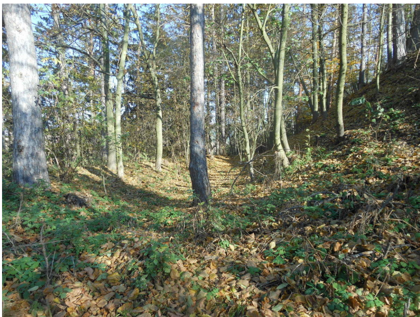
View of the ditch.