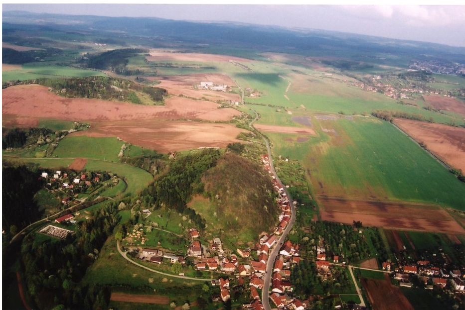
Aerial view of the hillfort from the west.