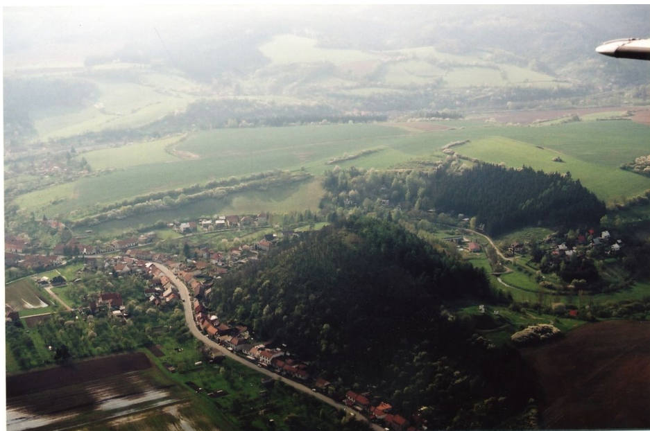
Aerial view of the hillfort from the south.