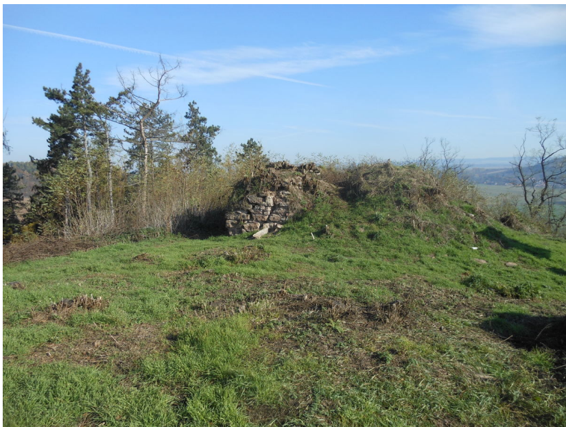
View of the chapel walls from the west.