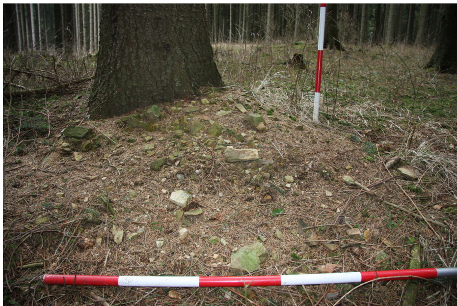
Extracted rocks – spoil.