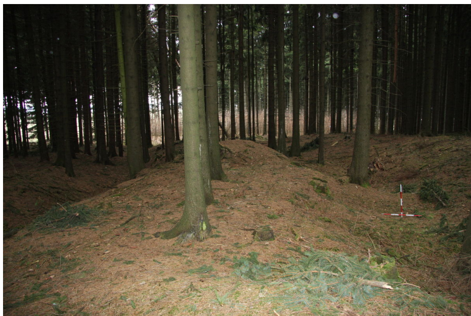
A pair of oval pinges.