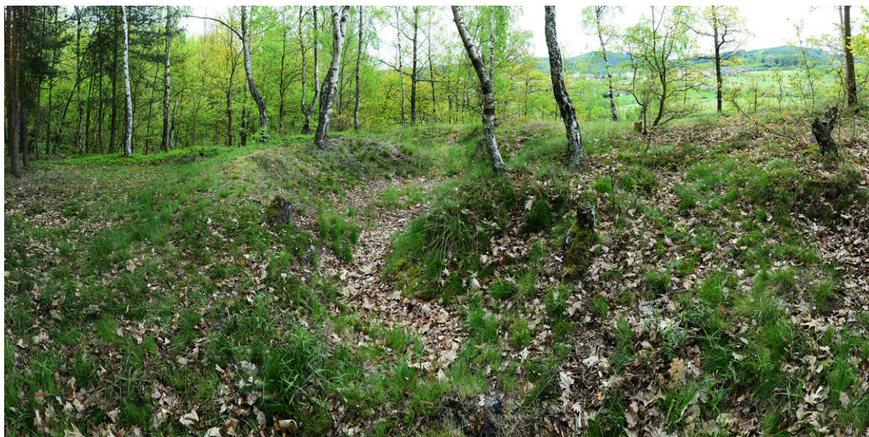
Sunken feature on the acropolis, probably remains of the church of Tašovice.