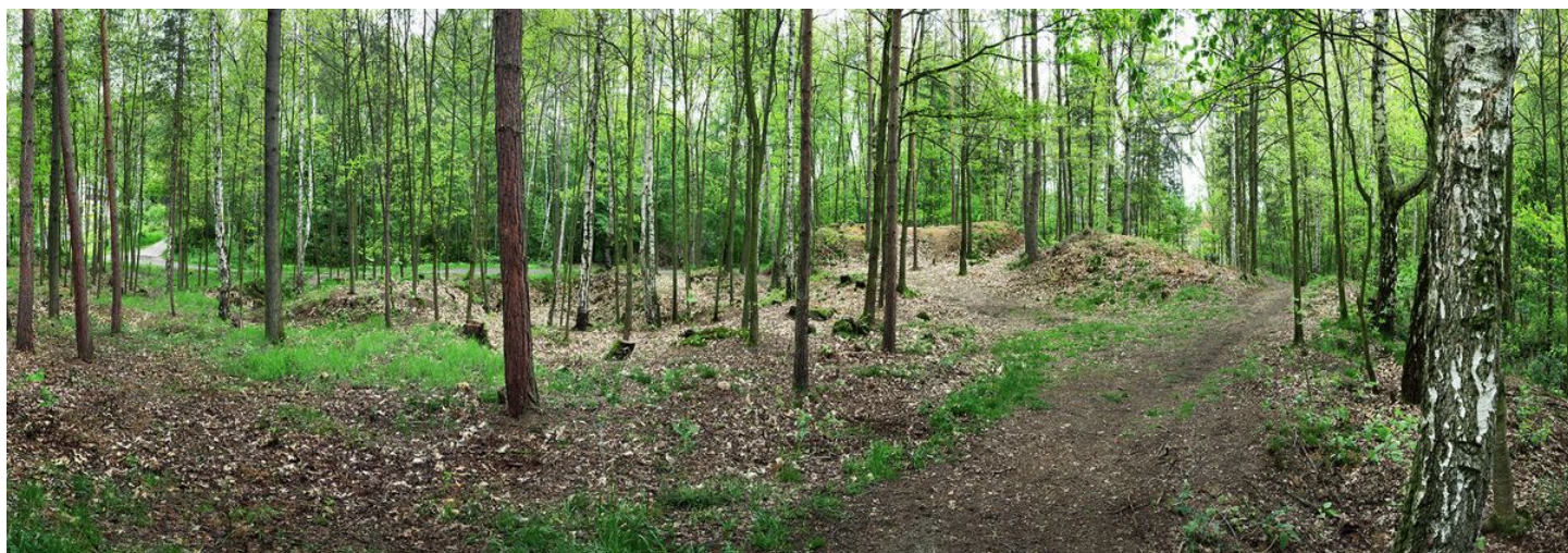
View from the acropolis on heavily damaged inner bank.