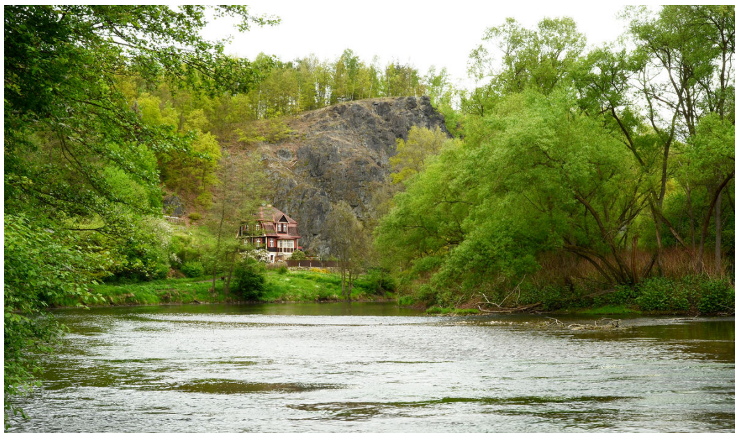
Rock outcrop, taken from river.