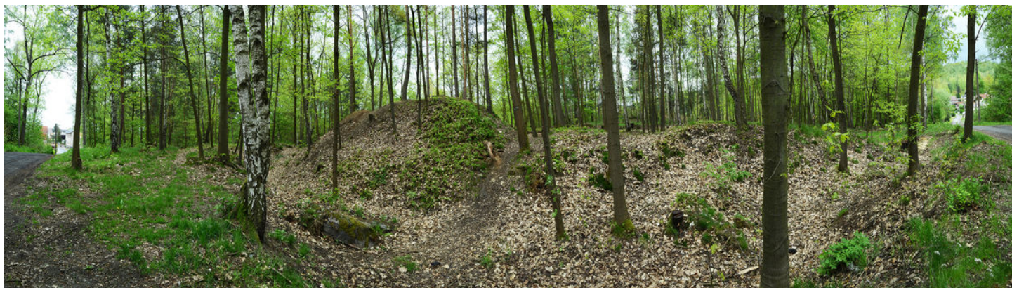
View from the bailey on the inner bank.