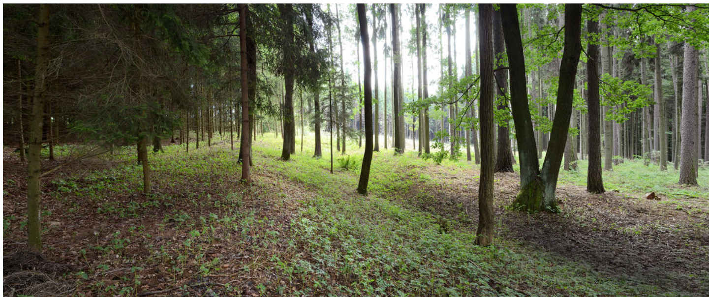
Several lines of banks.