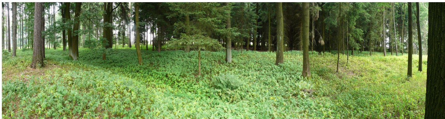
Banks of the circular area.