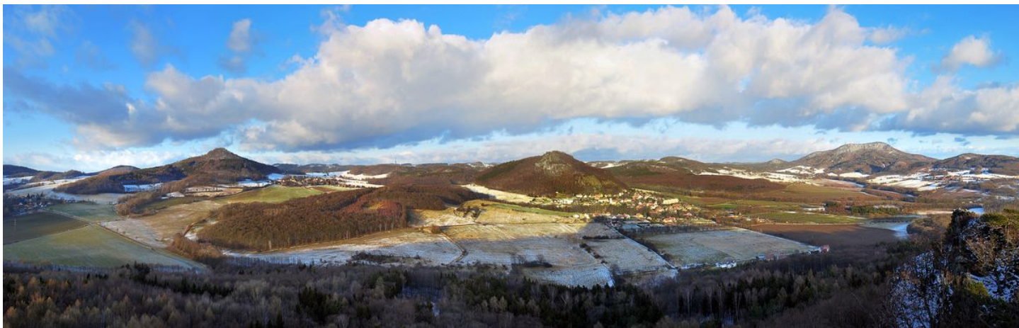
Panoramic picture of Třebušín region. Castle 'Panna' (left), Castle 'Kalich' (centre) and Castle 'Litýš' (right).