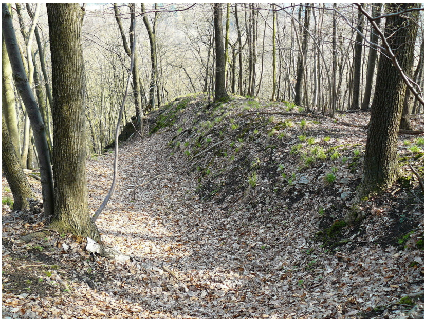
Bank fortification in the northern foreground of the castle.