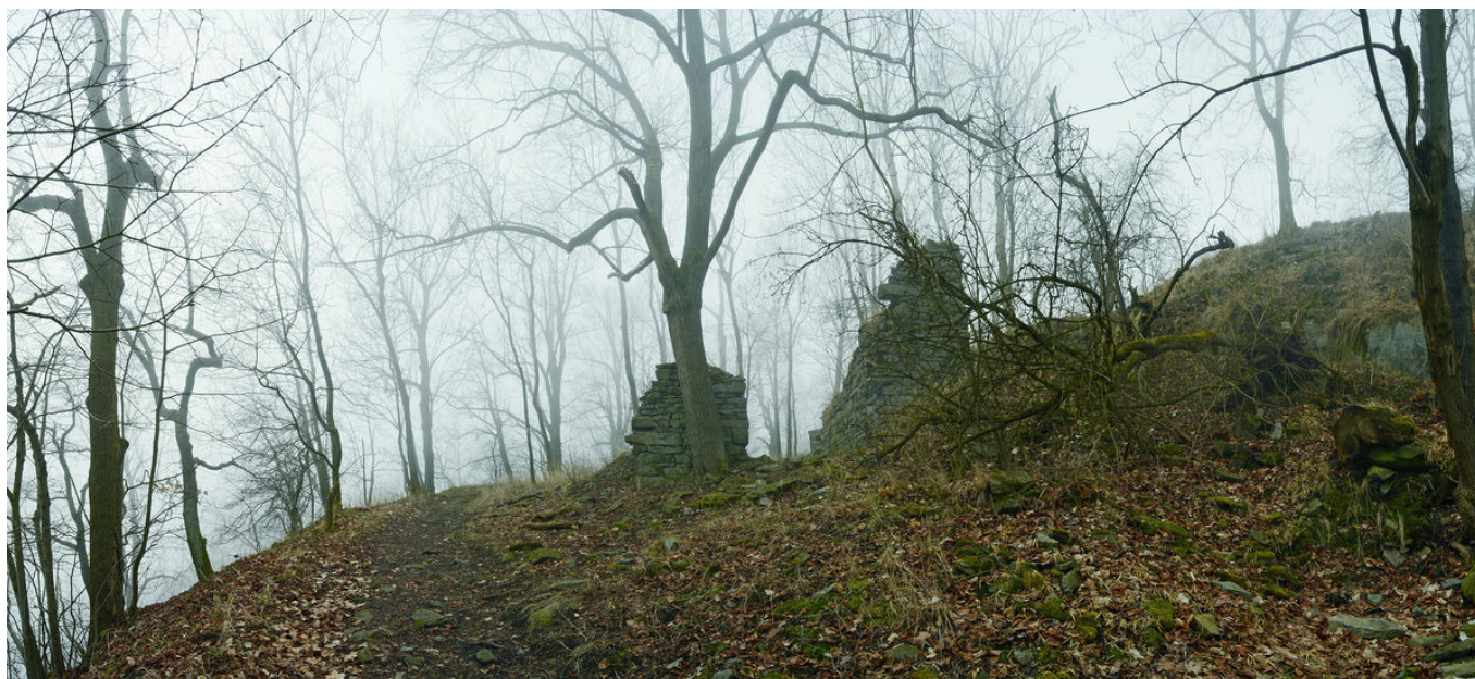
Fifth gateway - the entrance to the castle.