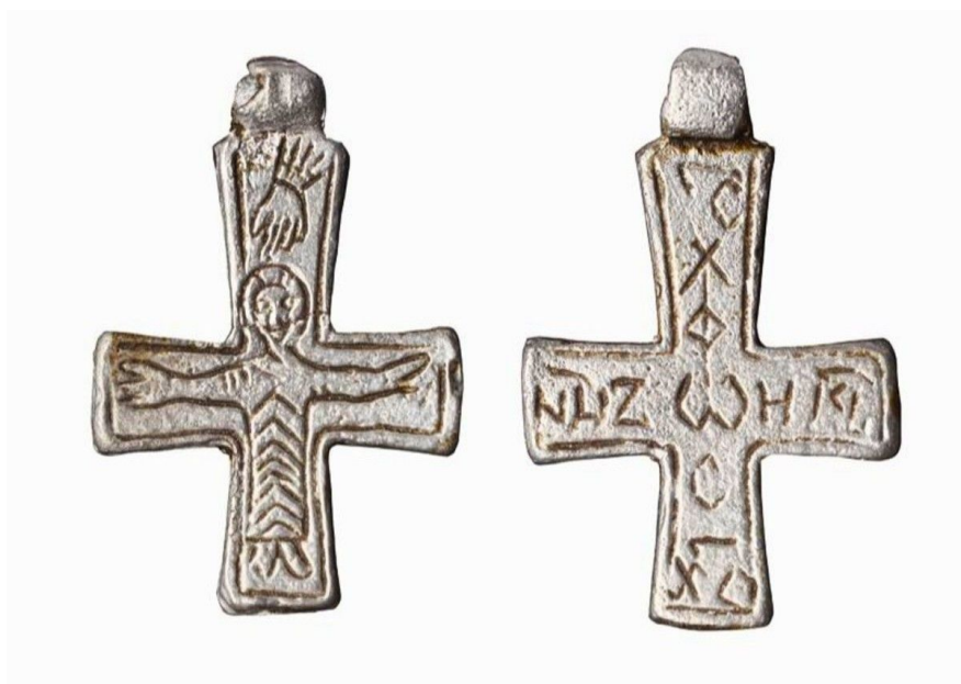
Lead cross with an engraving of the crucified Christ and the Greek inscription ΖΟΗ(Ε)Σ-Χ(ΡΙ)ΣΤΟ)Σ-ΦΩΣ-ΝΙΚΑ, 9th century. Moravian Museum.