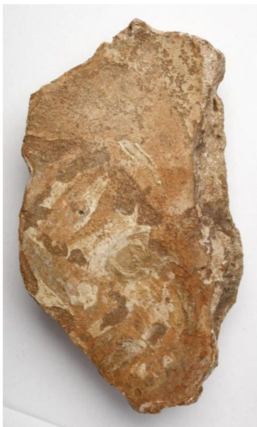
Plaster fragment decorated with a painting depicting a human face, 9th century. Moravian Museum.