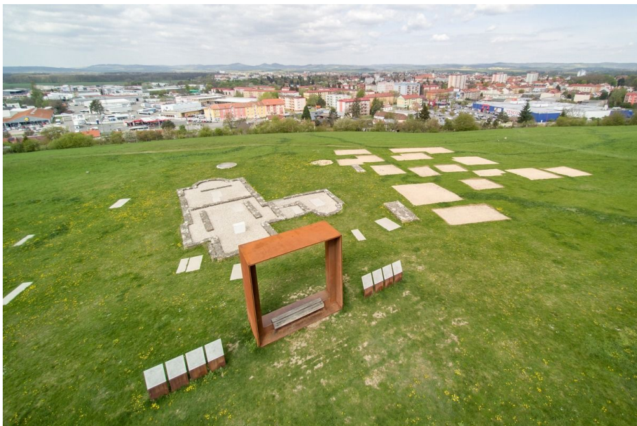
Reconstruction of the church foundations with adjacent graves and the ground plans of settlement structures.