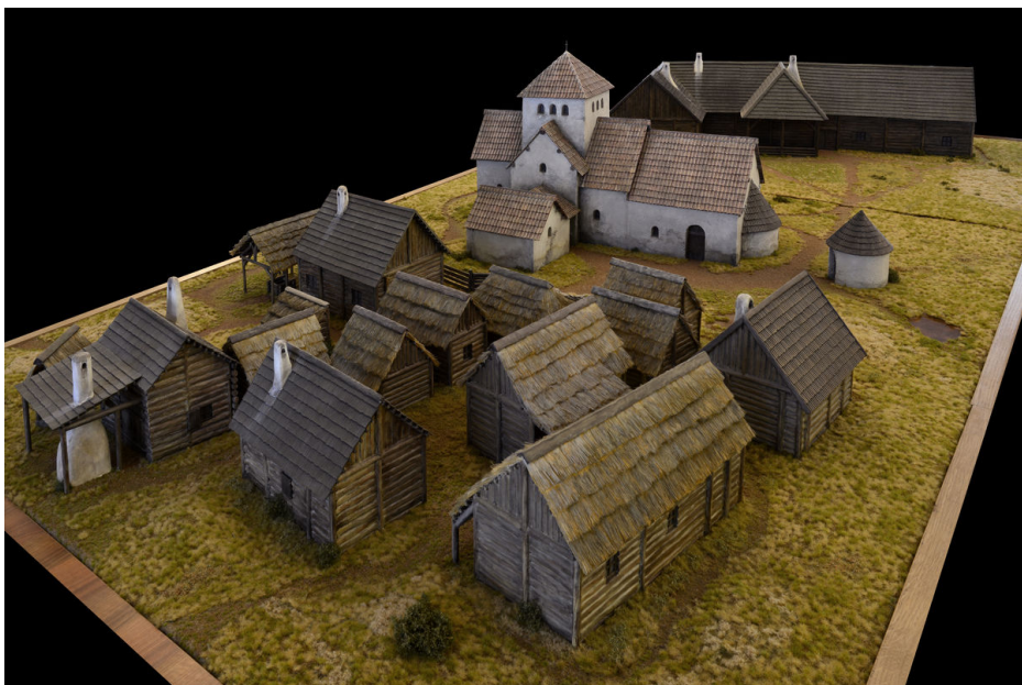
Reconstruction of the possible appearance of the church complex at Sady (St Methodius' Hill). Author of the modelu R. Míka, M' Plan. Photo B. Tesařová, 2025.