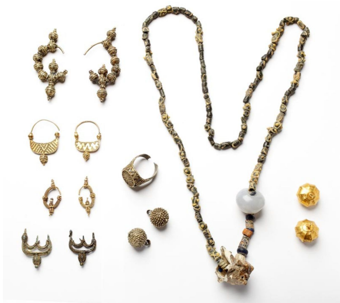
Grave goods from the rich female burial (209/59) known as "Sady Princess", 9th century. Moravian Museum.