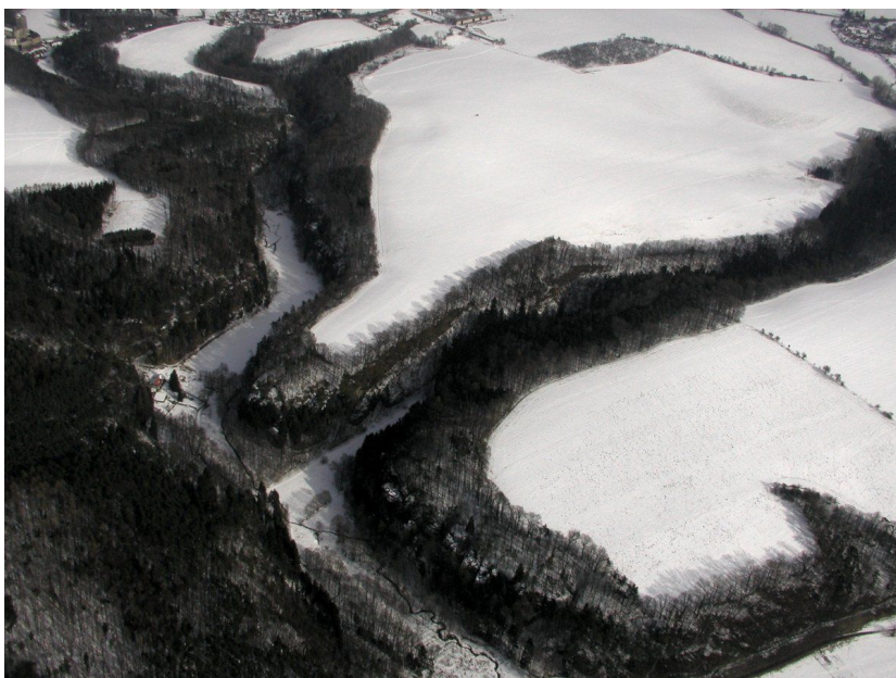
Aerial view of the hillfort Poráň.