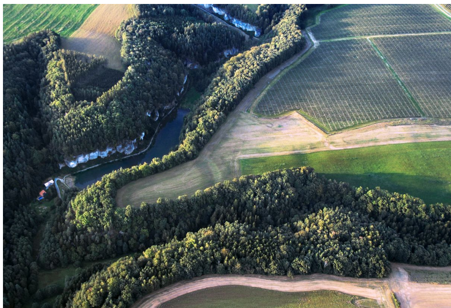
Aerial view of the hillfort with visible ditches.