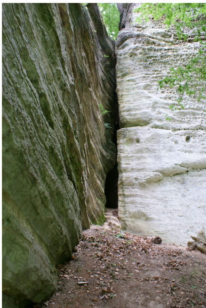
Entrance to the Knobloch-Skálova Cave.