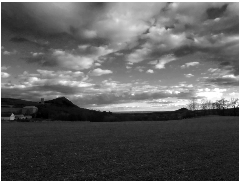
View from the hillfort across the Eger valley.