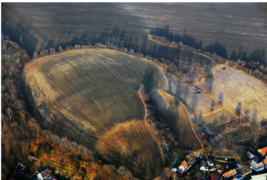
Aerial view of the hillfort.