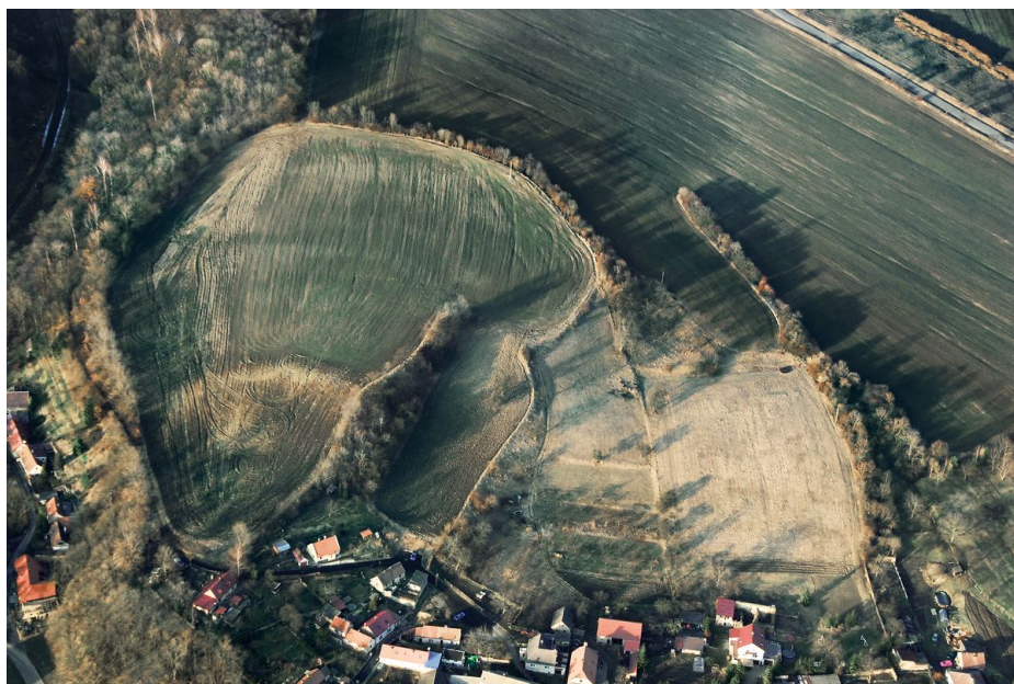
Aerial view of the hillfort.