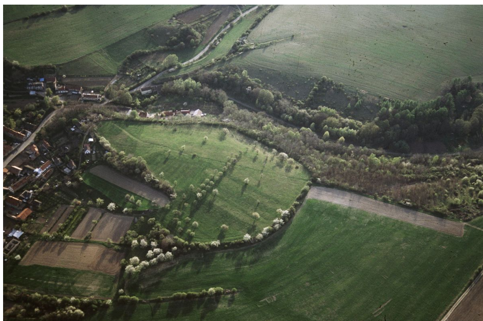
Aerial view of the hillfort.