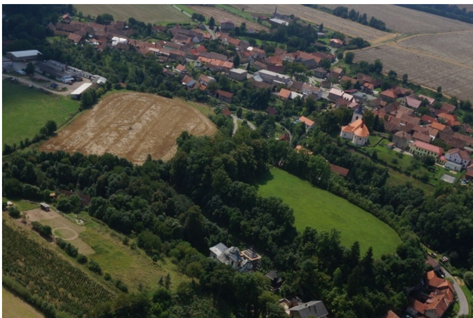
Aerial view of the hillfort.