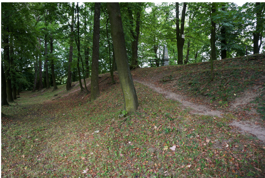
Hillfort's fortification, taken from southwest.