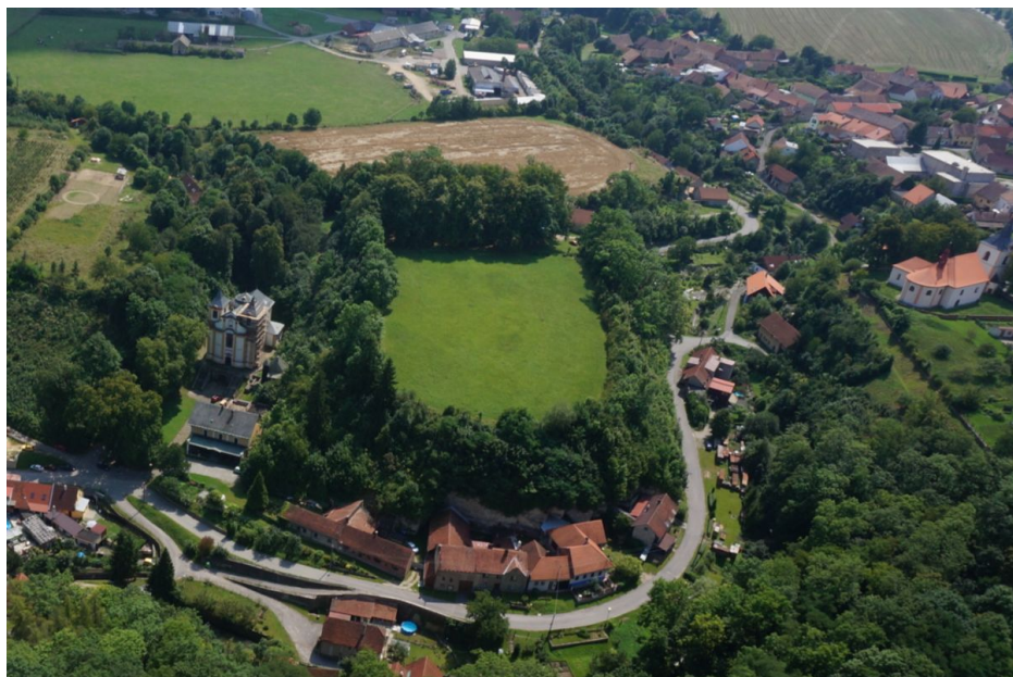
Aerial view of the hillfort.