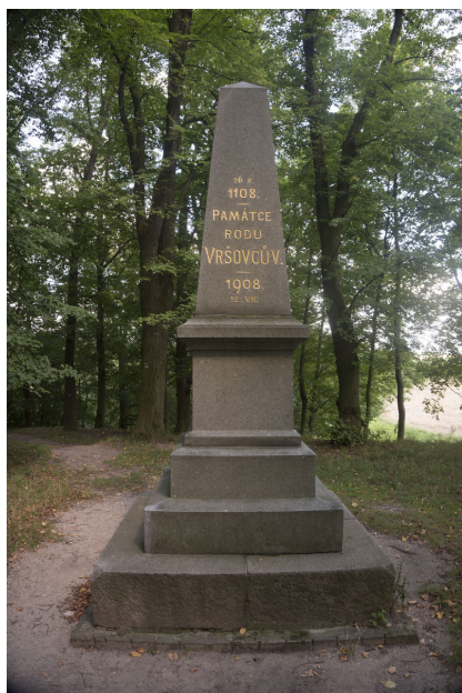
Memorial in the memory of slaughtering of the Vršovci noble family in 1108, built in 1908.