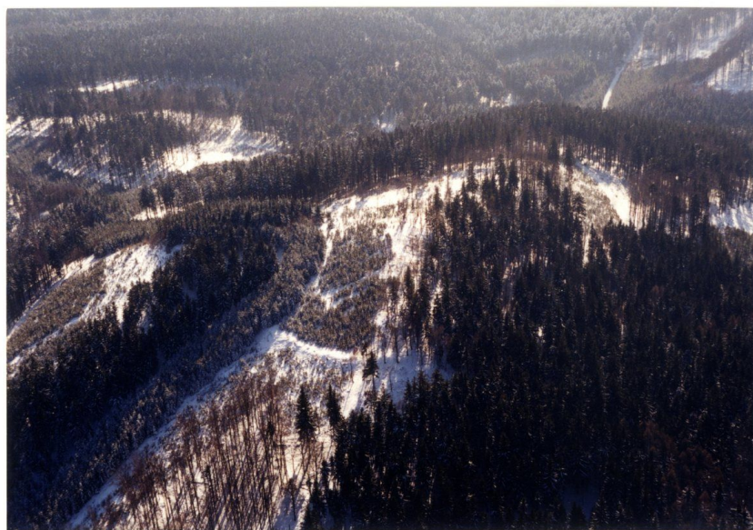
Aerial view of the site.