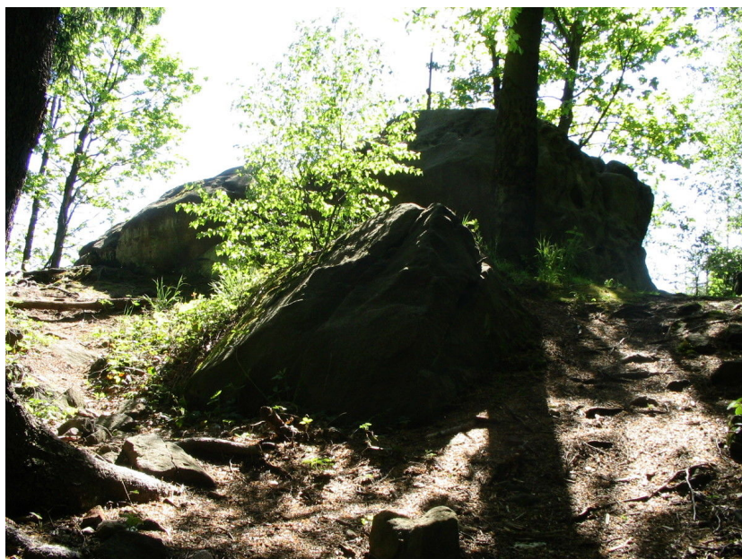
A rock formation called Čertův kámen ('Devil's Rock').