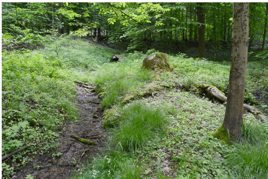
Spring basin, taken from west.