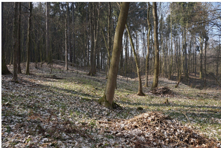
Surface relicts above eastern edge of the spring basin.