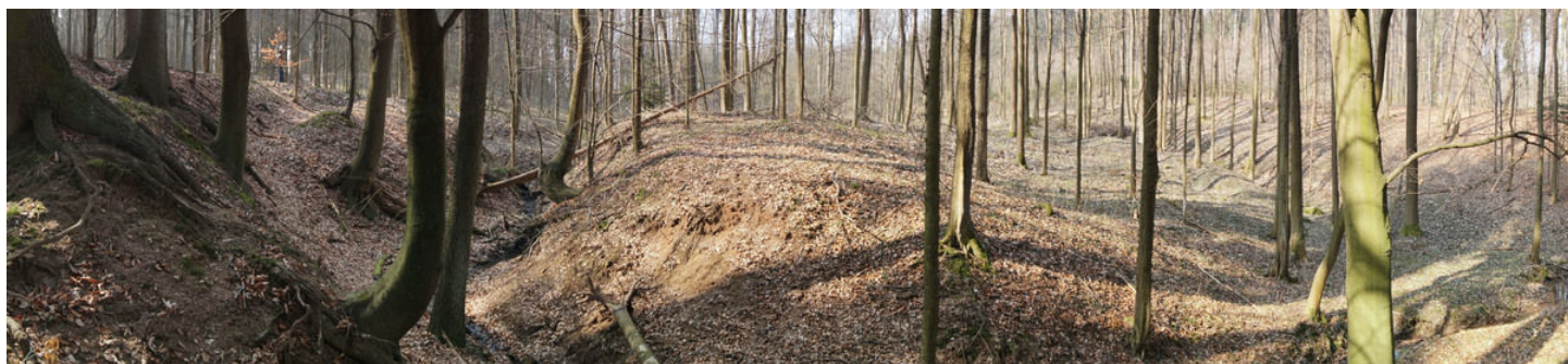
Pond bank with a visible millrace.