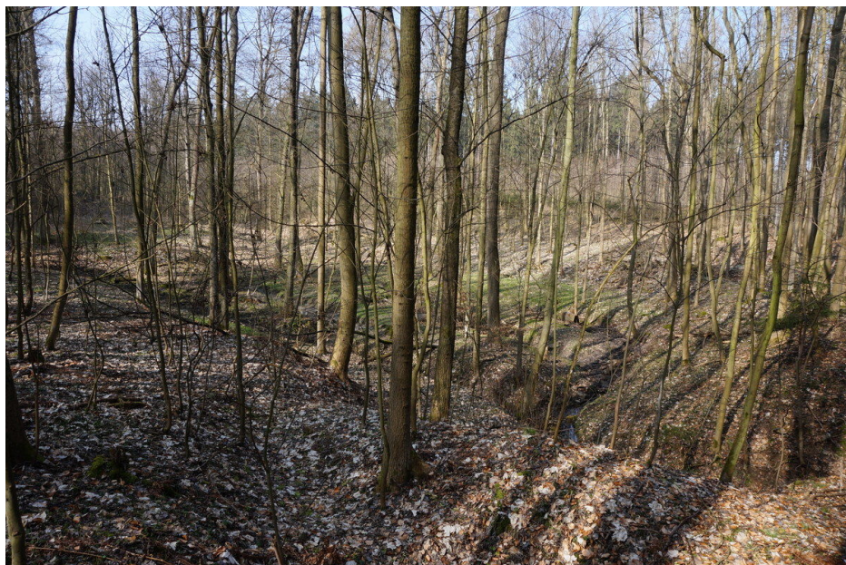
Spring basin, pond dam (left) with an overflow on south side.