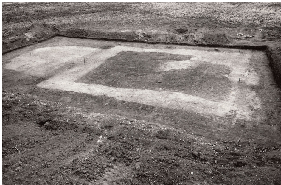
Ground plan of the church on the uncovered surface.