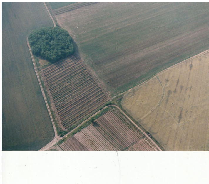
Aerial view of the deserted village of Koválov and the overgrown motte of Kulatý kopec.