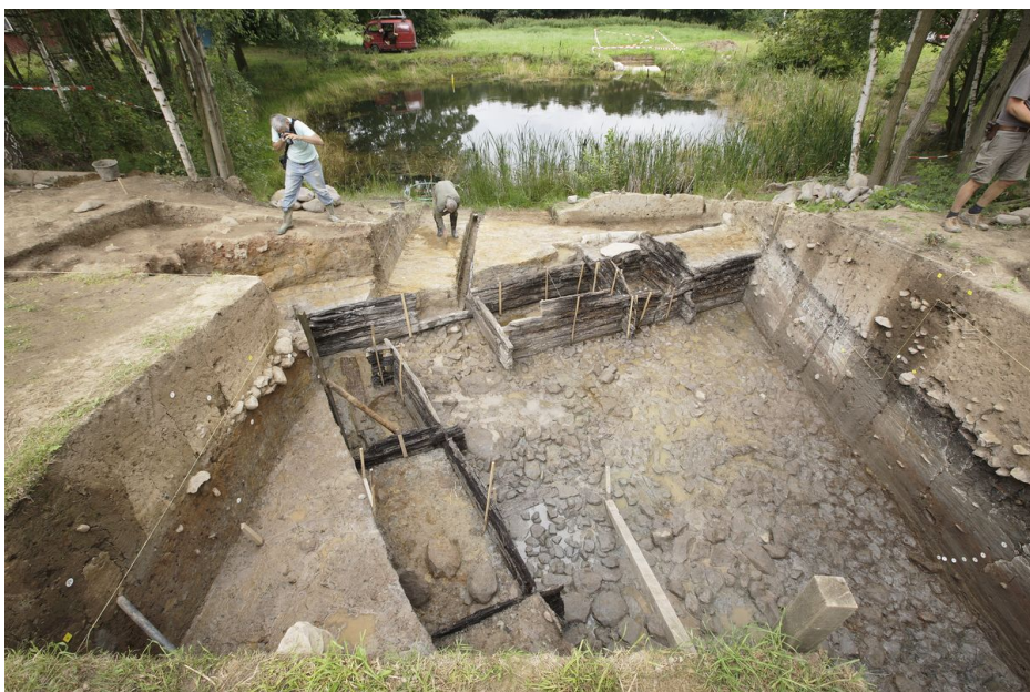
Water tank on the bailey in the course of archaeological field work.