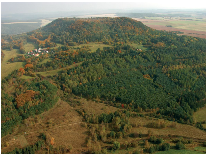
Aerial view of the Vladař Mt.