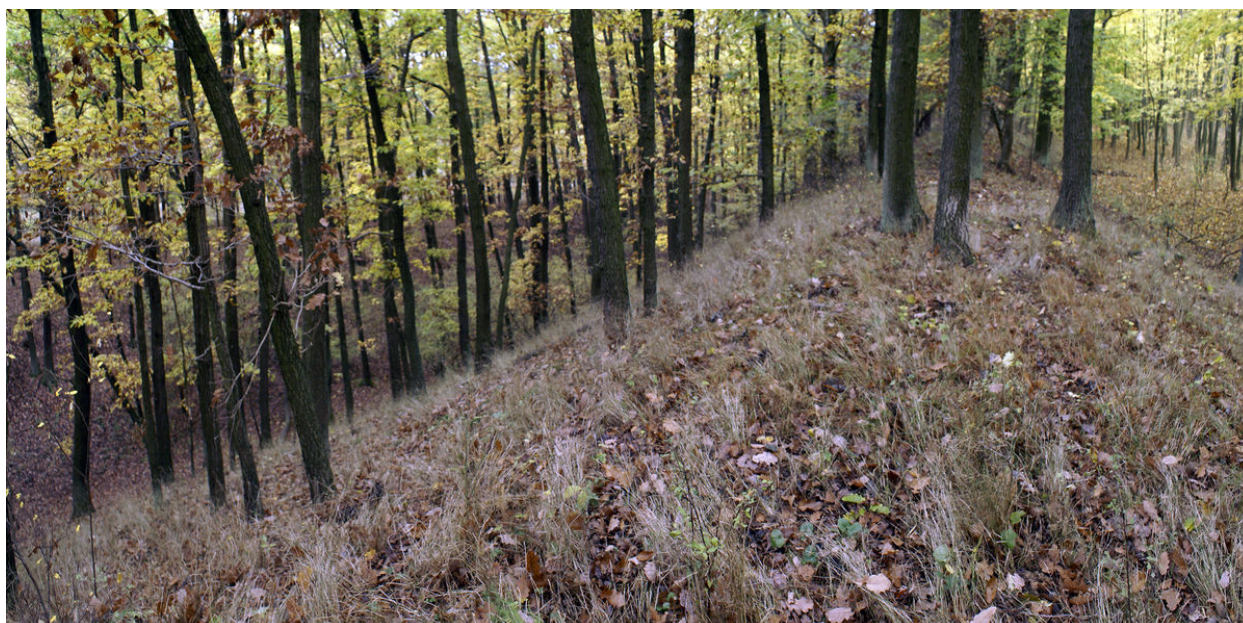
One of the inner banks at the hillfort Vladař.