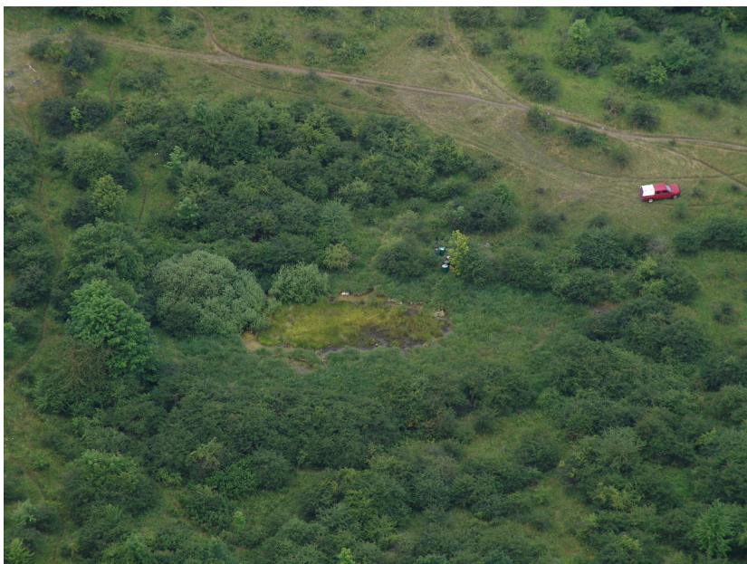
Pond on the acropolis during excavations in 2004.