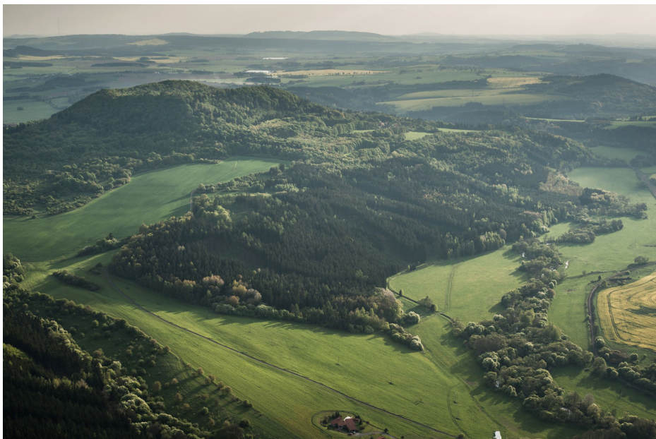
Vladař hillfort with extensive baileys.