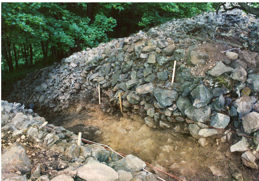
Cross-section of the inner stone bank on the acropolis.