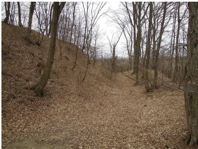
Settled hill of the small castle with ditch and outer rampart.