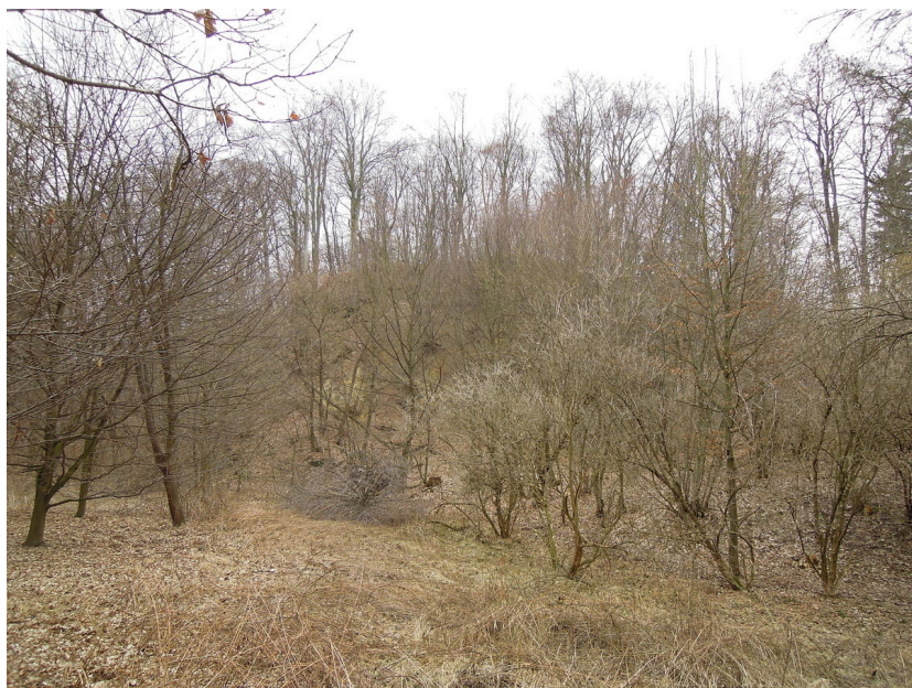
View of the site from the south.